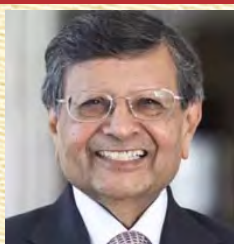
Padma Bhushan Awardee Dr. Jagdish Sheth Atlanta GA USA